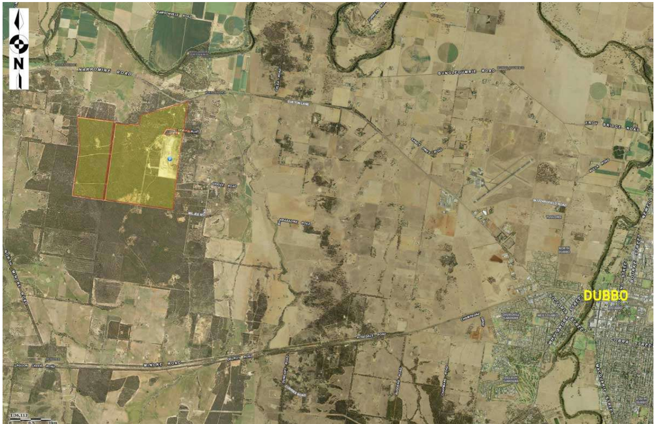
Figure 1 – Location Map:

SITE ACCESS: The Whylandra Waste & Recycling Centre is located ~12 kilometres north west of the Dubbo township centre and is accessed off the Mitchell Highway along Cooba Road . Lockable security fencing / gates are situated to the east of a weighbridge / gatehouse which itself acts as the primary site access control point during public operational hours. The site is open to the public between 8 am to 5 pm Monday to Friday and 9.00 am to 5.00 pm Saturdays and Sundays AND closed Good Friday and Christmas Day .