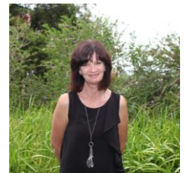
Support Coordinator and Educational Leader