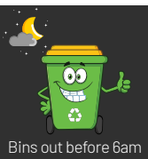
Bins out before 6am