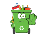
Bins over 65kg will NOT be collected

For more waste and recycling information refer to Council's website dubbo.nsw.gov.au or contact Council on (02) 6801 4000.