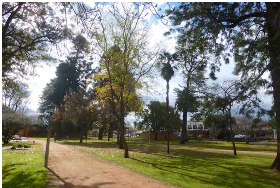
Figure 4. Cameron Park. Over mature specimen trees and lack of planting structure within the park reduces its appeal.

Replacement tree planting has occurred over time however it appears to lack any formal structure that is paramount to the philosophy of Victorian era parks.