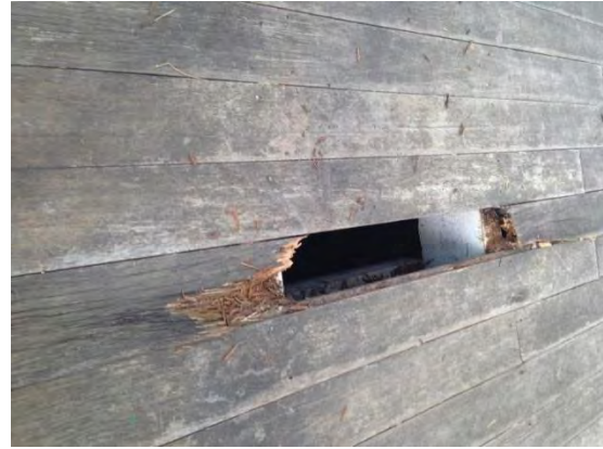
Figure 3. Cameron Park Rotunda floor 8 December 2016

Many of the original trees have also been removed over the years, with the few original trees now in advanced state of decline (eg: the Bunya Pine in the background in figure 4).