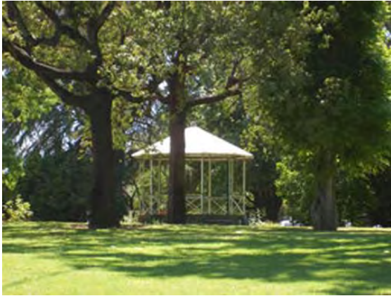
Figure 2. Cameron Park Rotunda