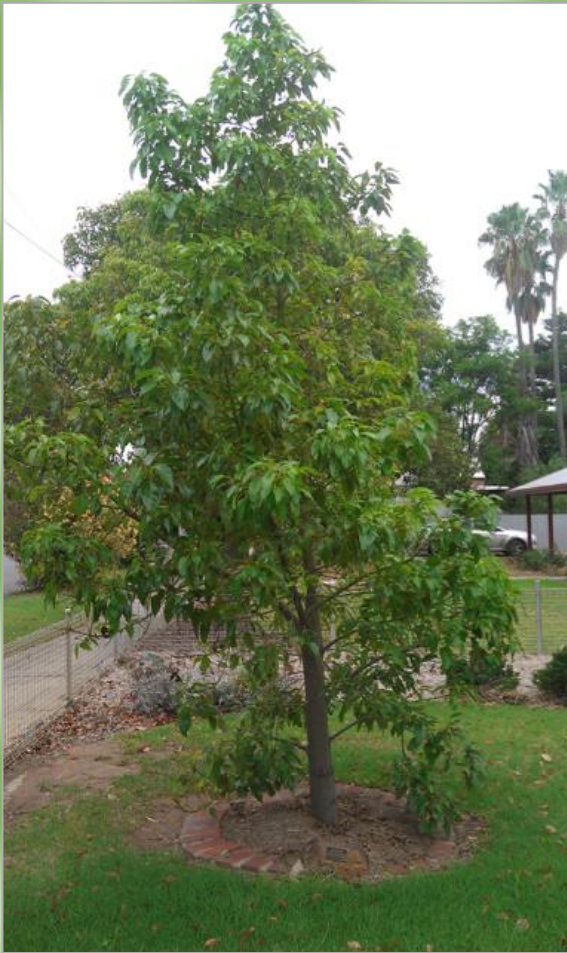
Above tree was planted in Jerilderie in 2000.